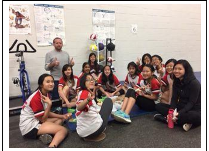
The Grade 6/7 Volleyball Girls team are enjoying a brief break at the Play Day Competition!